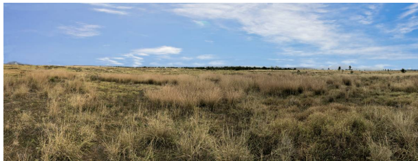
Rehabilitated land on the site of the former Drayton open cut.

Working at capacity, the solar farm would generate enough energy from the sun to power about 10,000 local homes.